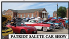
PATRIOT SALUTE CAR SHOW

Honoring the Dayton VA's Essential Employees, Veterans, and First Responders and remembering the Anniversary of 9/11