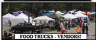
FOOD TRUCKS - VENDORS!

Sponsorships Available (email or call for info)